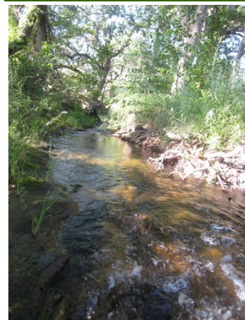
A bioremediation wetland, or bioswale, will clean polluted parking lot runoff before it reaches Clear Creek. (Pictured Above)