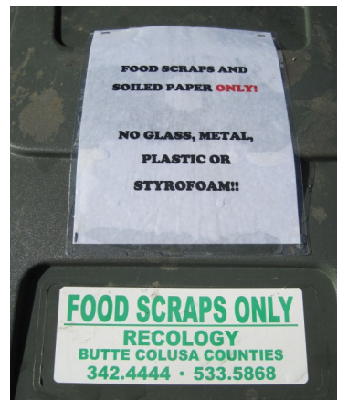
In cooperation with Facilities and the Ag Department, Dining Services reduces their waste stream by composting food scraps. (Pictured Above)