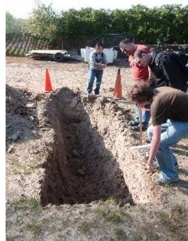
Student interns from the MESA program are designing a “test bioswale” for Phase II of the BWELL Project. (Pictured Above)

Overall, the MESA BWELL Project models how an idea creates opportunities for professional development, sustainable actions, and lifelong commitment when collaboration occurs outside the classroom between an academic learning community of students, faculty, and community mentors.